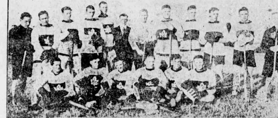
FOUNDATION TEAM OF VICTORIA, CHAMPIONS OF BRITISH COLUMBIA.