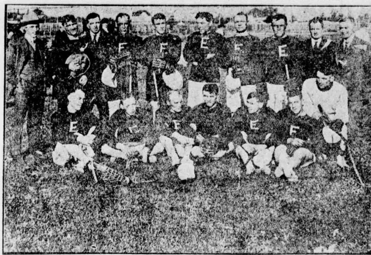
EDMONTON TEAM, CHAMPIONS OF ALBERTA.