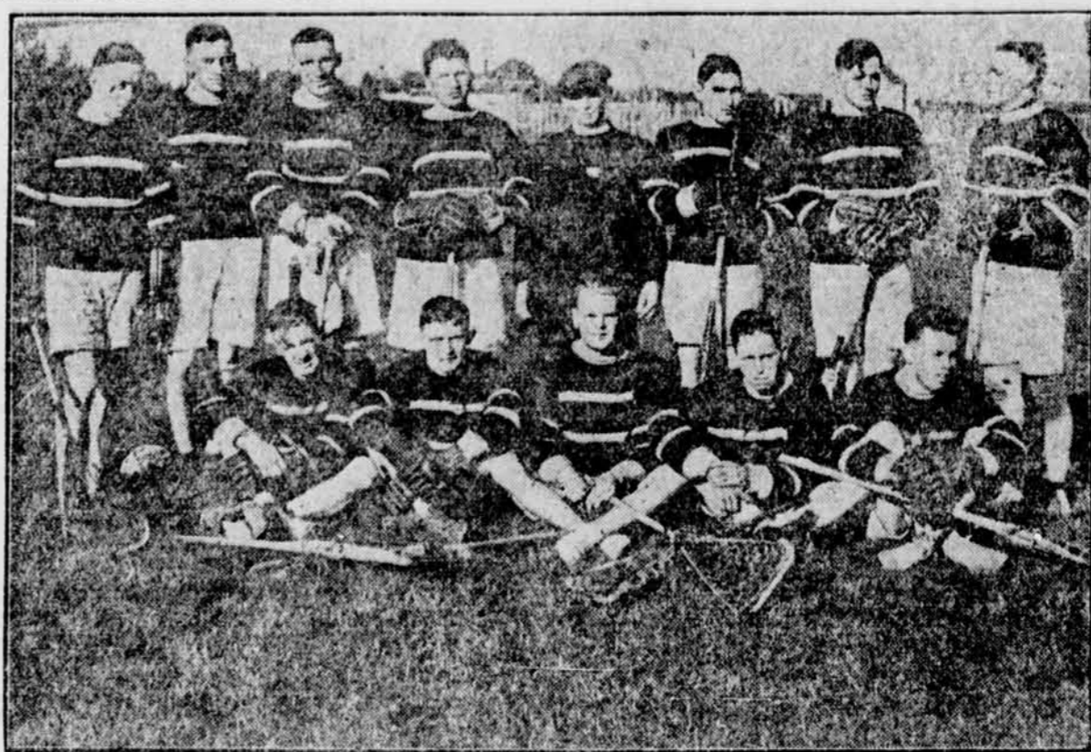
ST. SIMONS TEAM, TORONTO.