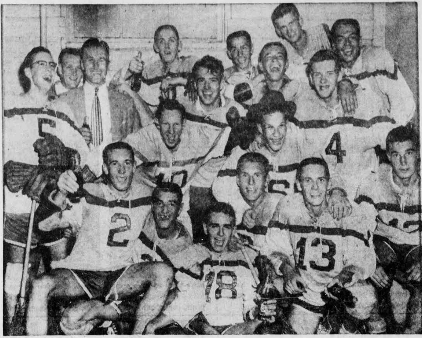
JUBILANT: Manitoba all-stars whoop'er up after eliminating Long Branch Monarchs, the Eastern champions, in the Canadian junior lacrosse semi-final, Saturday, 7-6. The local kids are on their way to Vancouver to meet the Coast champions for the Minto cup.